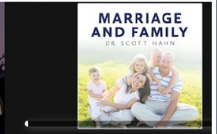
Marriage and Family: Love Unveiled