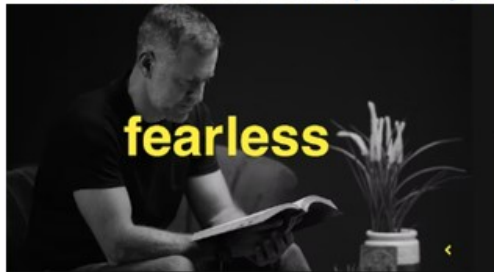
Fearless: A 7-Week Lenten Video Series